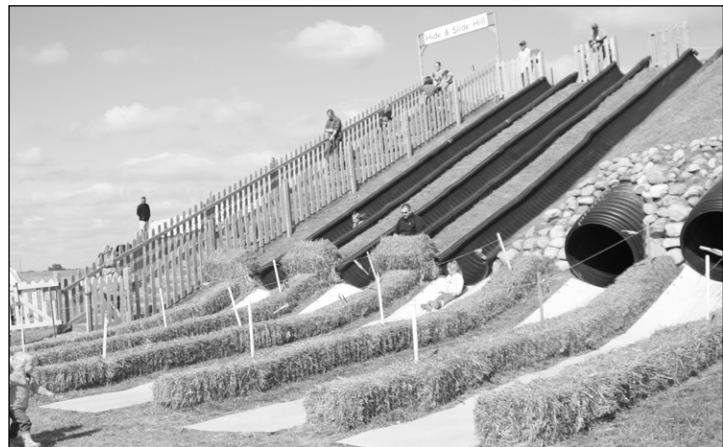
FUN-SEEKING families took to the slides at Ramseyer Farms in Wooster on a beautiful Saturday. Fall Festival weekends continue through the month.

For more information call 330-264-0264 or visit www.ramseyerfarms.com .